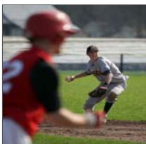
Hopkins Academy V Athol High School Baseball 4/26/11