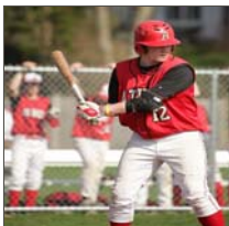
Hopkins Academy V Athol High School Baseball 4/26/11