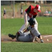
Hopkins Academy V Athol High School Baseball 4/26/11